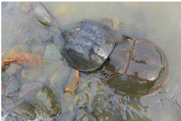
Taunton Bay is the northern range limit for the horseshoe crab ( Limulus polyphemus )